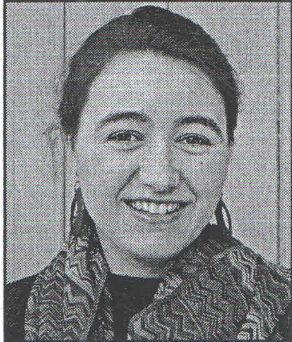
Book reviewed by Jocelyn Langer Village School Spanish, art and recorder teacher

The soft blue light that tints the illustrations of Audrey and Don Wood's "The Napping House" might at first seem insignificant. The book's cover is blue; the folds of the curtains cast a blue shadow, as do the wrinkles of the grandma's night gown; the mirror reflects blue light, and even the dog's fur is tinged with blue. A sleepy feeling radiates from the pages, almost causing the reader to yawn.